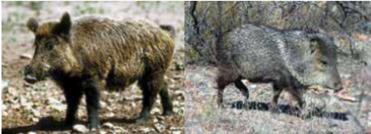
Feral hogs (left) are very different from native javelina (right). Feral hogs are non-native and can cause extreme damage to habitat and infrastructure. Javelina are a native species and should be managed as such.

Some Tribal Members have expressed concern over the damage that javelina can cause to infrastructure in the backcountry and the challenges that this may present. It is important to understand the difference between feral hogs and javelina. Javelina root for their food and leave evidence of overturned soil; most commonly at the base of trees, shrubs, or cactus. They are not known to cause extensive damage commonly seen with the presence of feral hogs. Feral hogs, not javelina, can cause major damage to back country infrastructure such as roads and water pipelines.